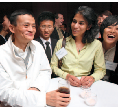
Students talk with Jack Ma, chairman of Chinese Internet company Alibaba.

The Chazen Institute is a gateway to the people and ideas that transform the global marketplace.