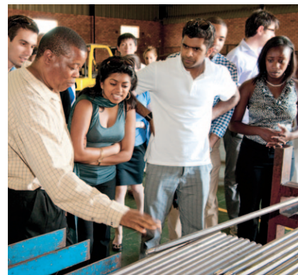
Students visit a steel factory in South Africa.

The Chazen Language Program offers noncredit, eight-week language courses for the Columbia Business School community. www.gsb.columbia.edu/chazen/language