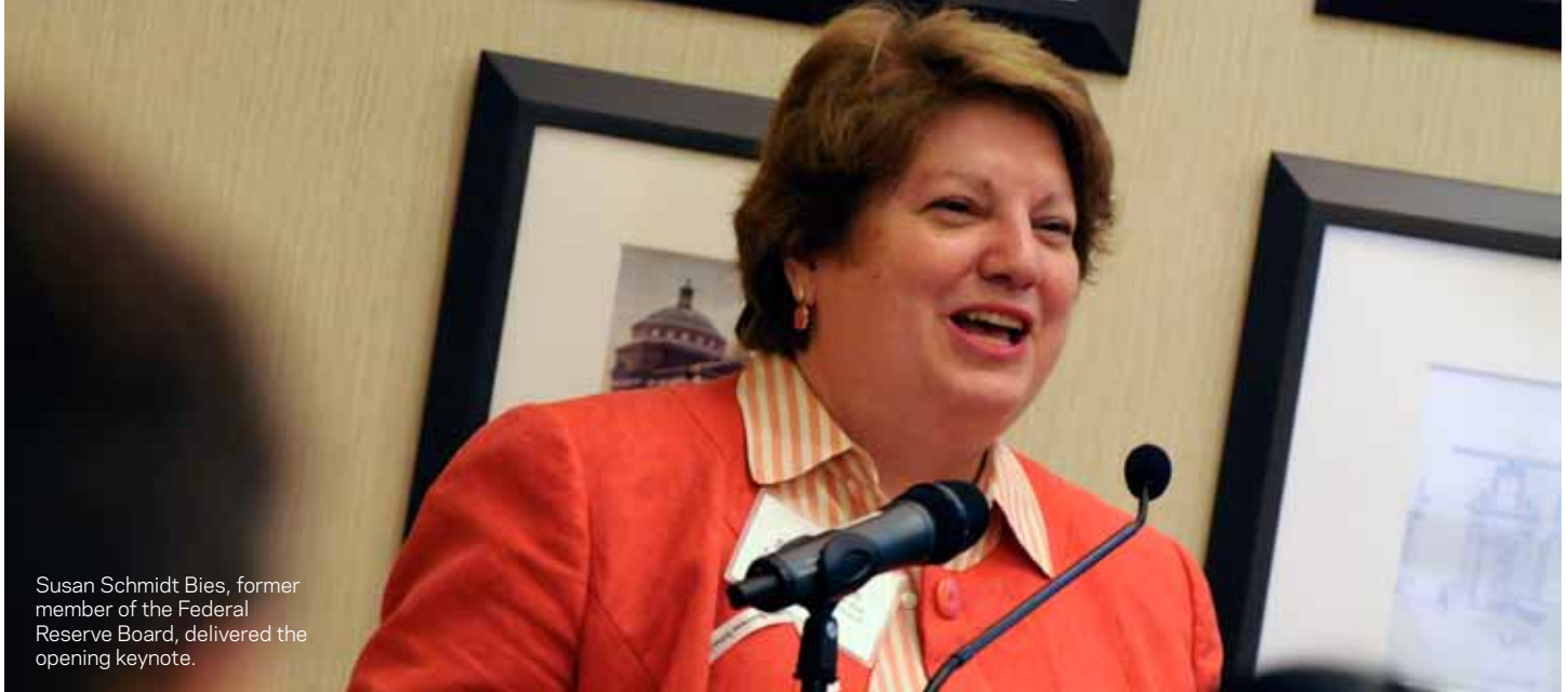
Susan Schmidt Bies, former member of the Federal Reserve Board, delivered the opening keynote.