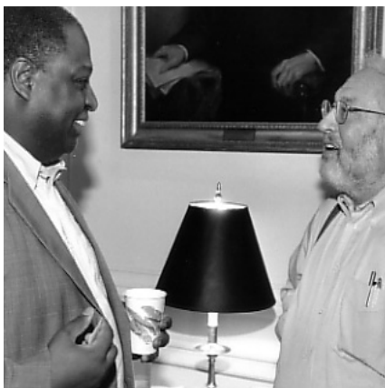
Mark Warner and Joseph Stiglitz, left to right

One participant said that pharmaceuticals would achieve a more consumer-friendly global price as a result of free parallel trade. Others countered that price discrimination is necessary to provide poor countries with essential pharmaceuticals and to save millions of lives.