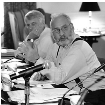
Peter M. A. L. Plompen and Joseph Stiglitz, left to right

Intellectual property is now seen as essentially similar to tangible property. However, the inherent “public goods” aspect of intellectual property makes it more prone to free riding and, consequently, rights holders typically argue that stronger protection is necessary to achieve adequate returns and optimal levels of innovation.