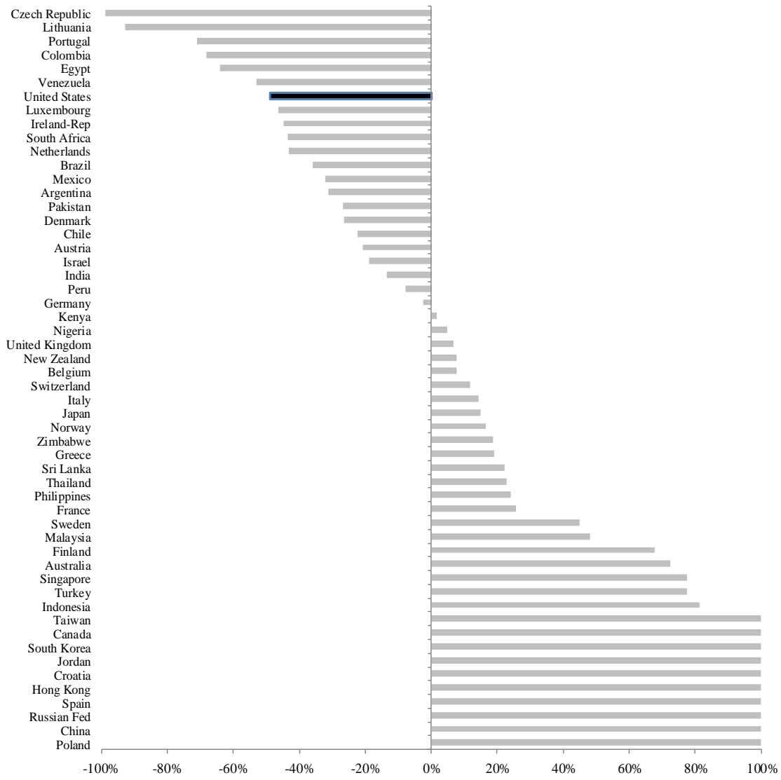
Percent change in listing counts: 1996 to 2012

This figure shows the percentage change in the number of domestic, publicly-listed firms from 1996 to 2012. Listing counts are from the WDI and WFE databases. Investment companies, mutual funds, REITs, and other collective investment vehicles are excluded. The initial sample comprises 72 countries included in Djankov et al. (2008). The sample includes the 54 countries with at least 50 listed firms in 1996. For example, the U.S. had a listing count of 8,025 firms in 1996 and 4,102 in 2012, a 49% decline. The figure caps the percentage change at 100%. Nine countries have increases in excess of 100%.