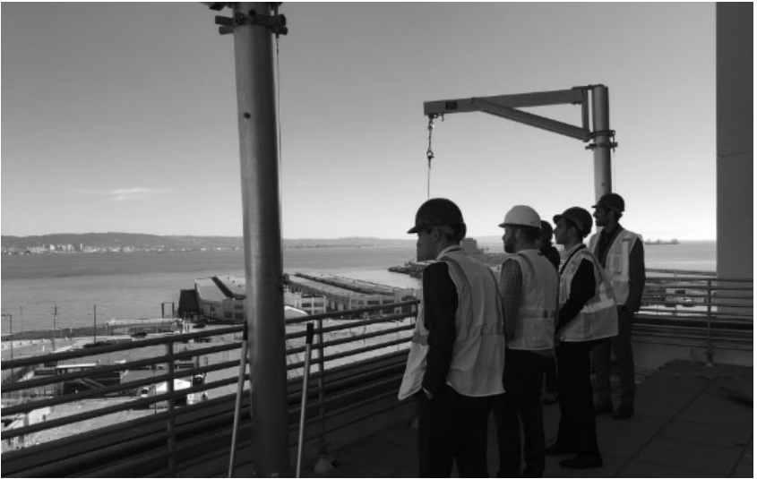
San Francisco REA Trek. Real Estate Association students tour One Mission Bay