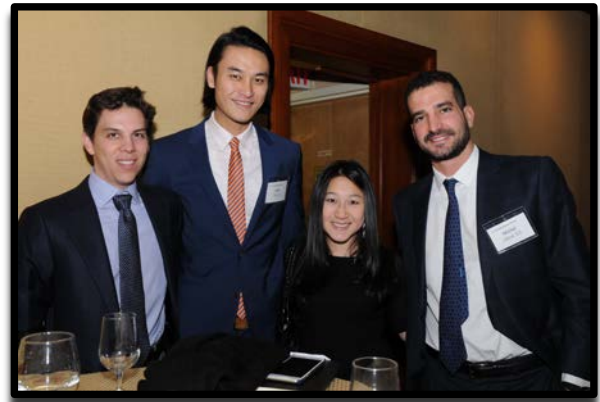
Value Investing Program students supporting their classmates at the Amici Capital Prize Competition.