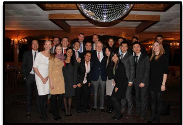
The 2014-2015 Omaha Trip Attendees.